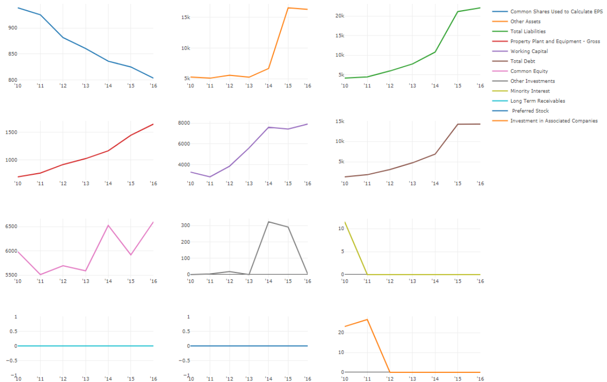
Figure 2: Sample of imputed Line Items for 2016 (2010-15 are Historical values)

Further, we have presented the line charts of the few imputed line items for the year 2016 below.